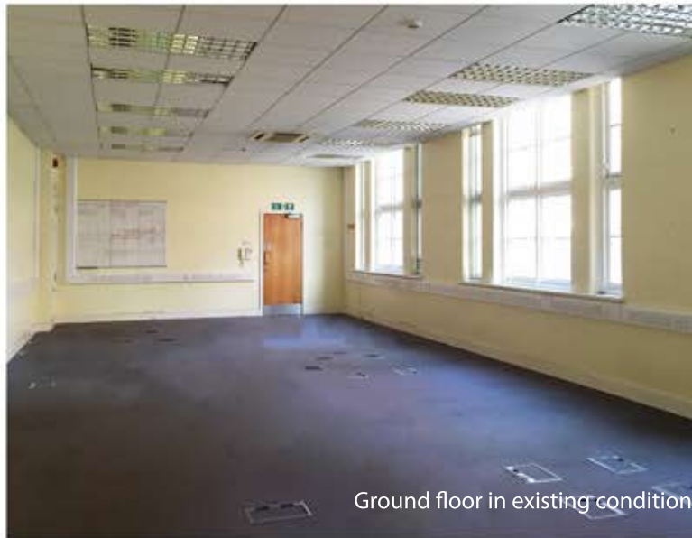
Ground floor in existing condition

MODERN OFFICE BUILDING, 3,500 SQ FT WITH PARKING TO LET/MAY SELL