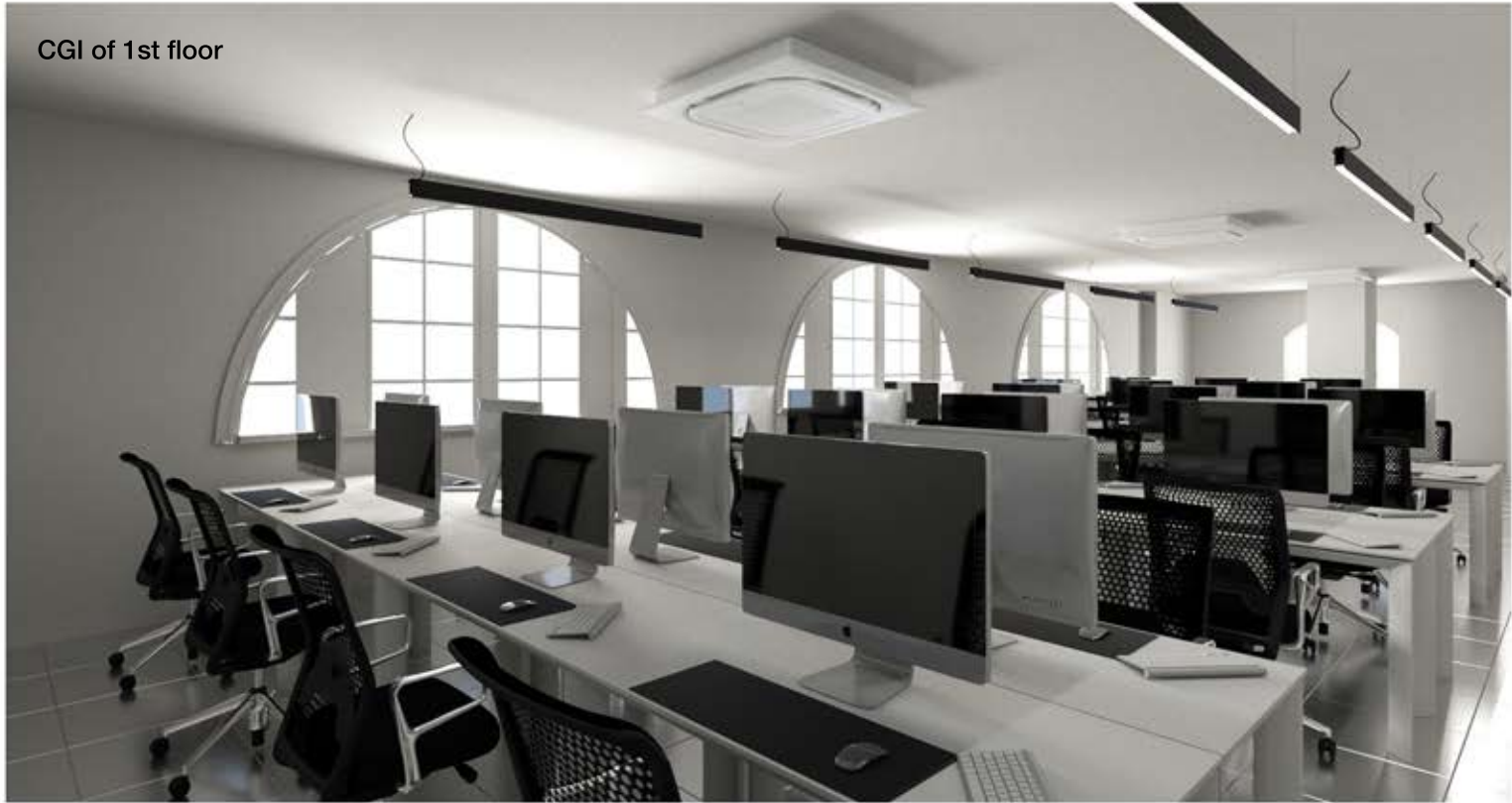
CGI of 1st floor

MODERN OFFICE BUILDING, 3,500 SQ FT WITH PARKING TO LET/MAY SELL